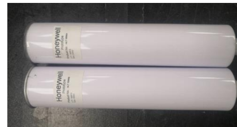
Separate syringe tube