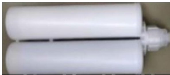
Integrate two-part tube 200+200cc