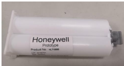
Integrate two-part tube 25+25cc