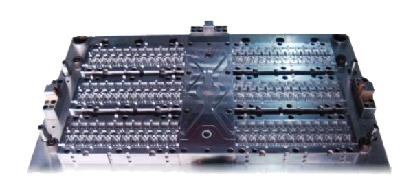
Designed for Epoxy, Polyurethane and Polyester Molds

Despite being silicone-based, it is completely compatible with epoxy molding compounds , as well as liquid hot- and cold-curing epoxy-, polyurethane and polyester resins . For EPDM, Nitrile and thermoplastic molding, please refer to LinqSil S200 , and for flexible or rigid integral foams, please refer to LinqSil S300 .