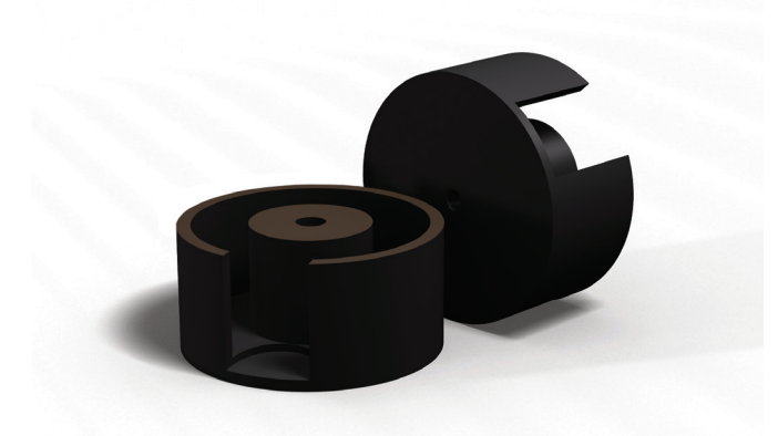
Superior Mechanical Strength for long product life

Epoxy binding resin for Class F capable Pot Cores